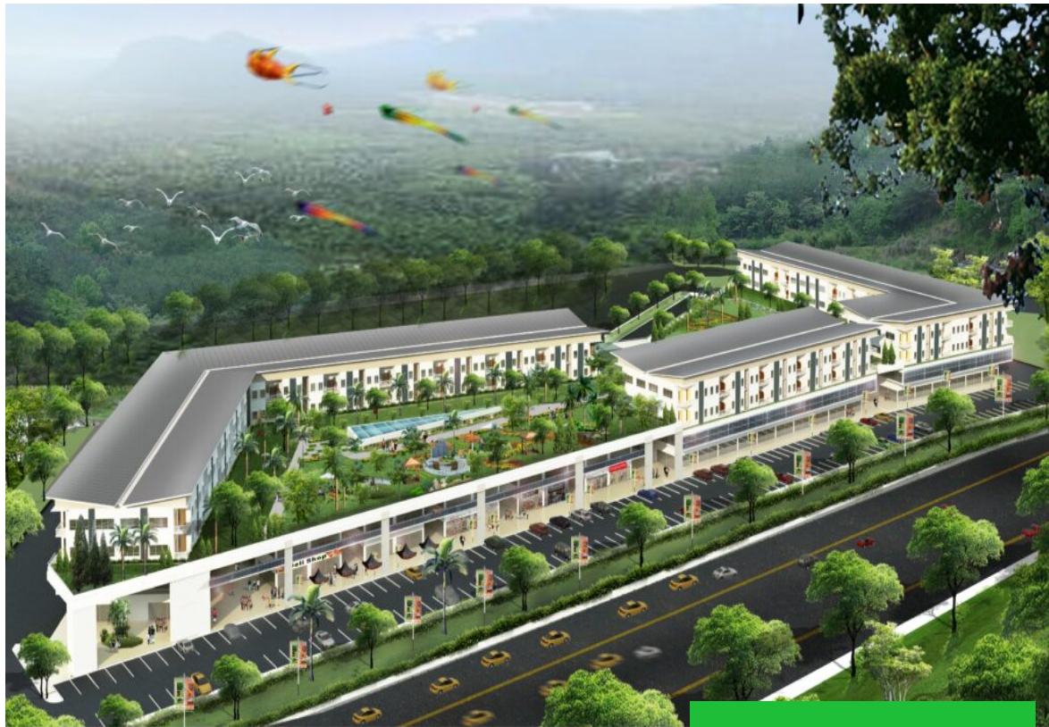
PROPOSED 4 STOREY SHOPPING MALL AND RESIDENTIAL DEVELOPMENT (ALL IN S)

Jln Sungai Moyan, 93250 Kuching, Sarawak, Malaysia